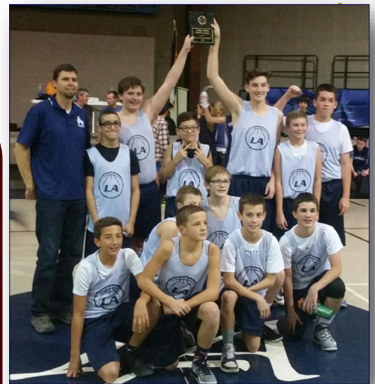
(Pictured above) The Boys Basketball 2016 League Champions!

LA's C team beat the B team at Saturday's scrimmage for a playoff spot in the B team tournament. The C team defeated WWA in the semi-finals but lost to Excel in the B team championship game 18-27. The B and C team wrapped up their season with six wins, two losses. Great effort on the court this season, gentlemen!